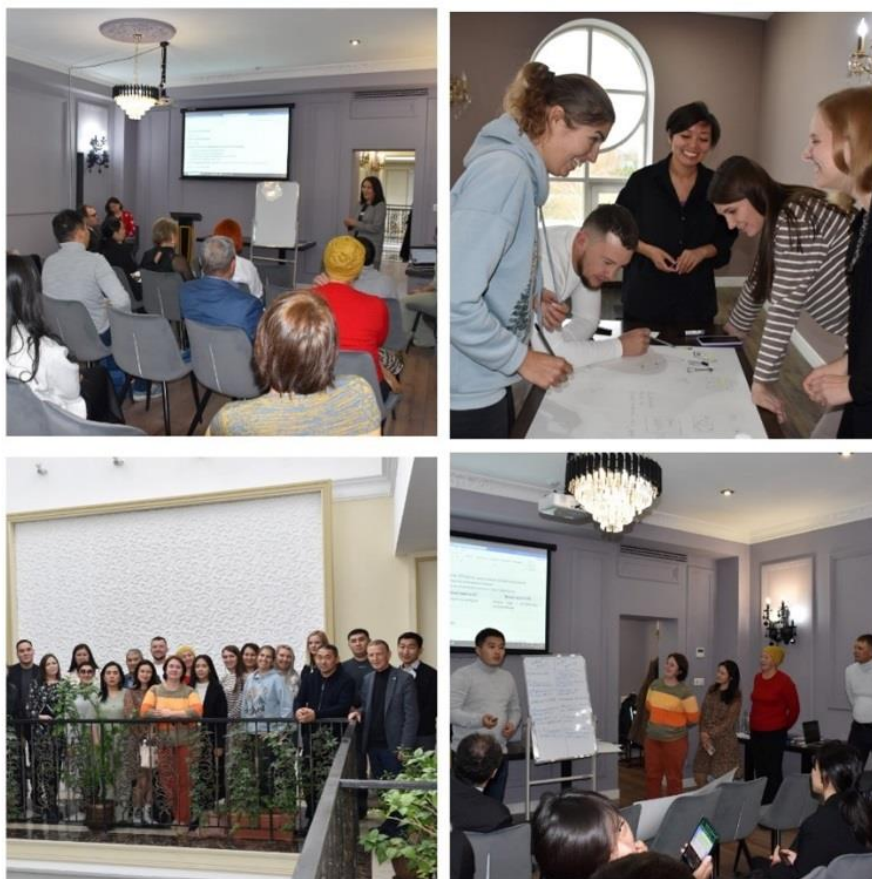
Рисунок 3. Семинар-тренинг в Усть-Каменогорске