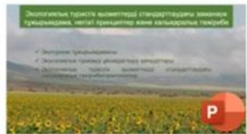
1 Экологиялық туристік қызметтерді стандарттаудағы заманауи тұжырымдама, негізгі принциптер және халықаралық тәжірибе