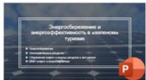
5 Энергосбережение и энергоэффективность