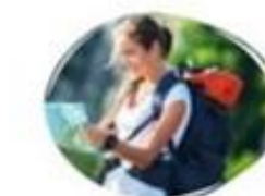
4 Қалдықтарды қайта өңдеу және тұрақты туризм