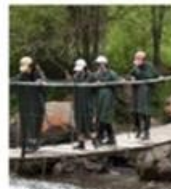
2 Экологиялық туристік маршруттар мен экологиялық турларға қойылатын жалпы және арнайы талаптар