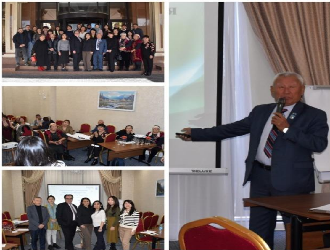
Рисунок 3. Семинар-тренинг в г.Шымкенте