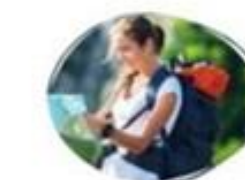
4 Управление отходами и устойчивый туризм