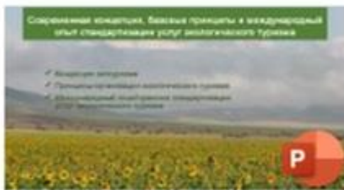
1 Современная концепция экотуризма