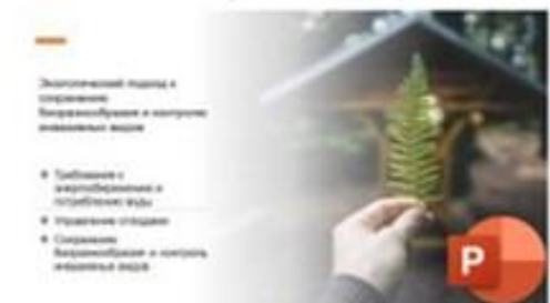
3 Экологический подход к сохранению биоразнообразия