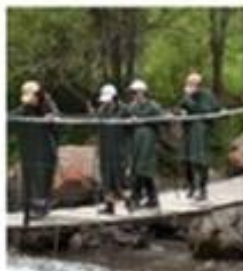
2 Общие и особые требования к экологическим маршрутам и турам