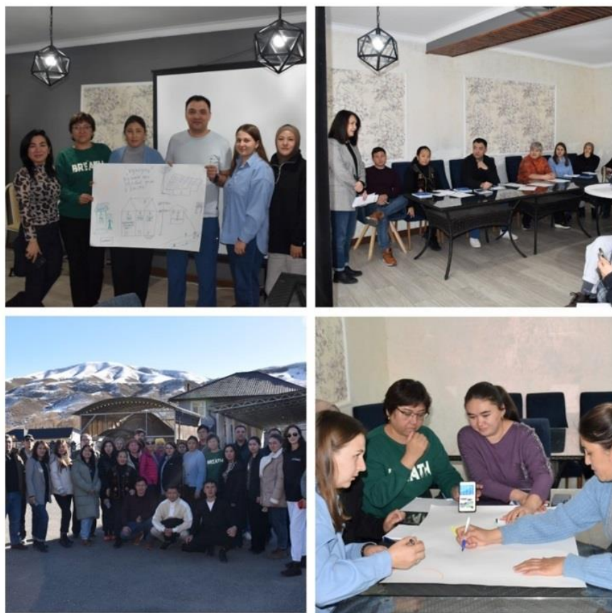
Рисунок 4. Тренинг-семинар в селе Саты